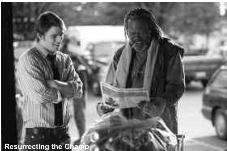
Resurrecting the Champ

No End in Sight Magnolia Pictures, documentary Lagoon (07/11/07)