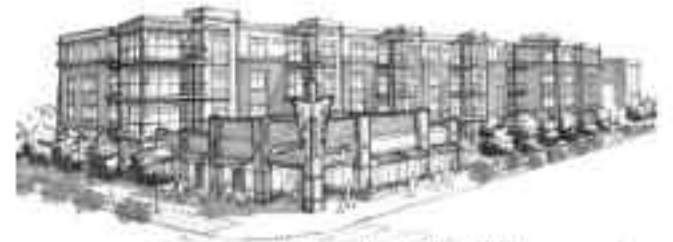
Illustration of The Wellstone