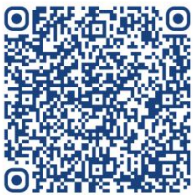
2026 Multifamily recycling grant guidelines (PDF)

Applicants may apply for up to $3,000 for bins and compostable bags and up to $20,000 for all other categories combined.