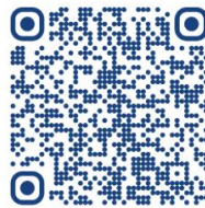
submit a multifamily recycling grant inquiry form

If you have questions about grants or want to talk to the apartment recycling program coordinator, email apartmentrecycling@hennepin.us or visit HennepinCounty.gov/apartmentrecycling for more information.